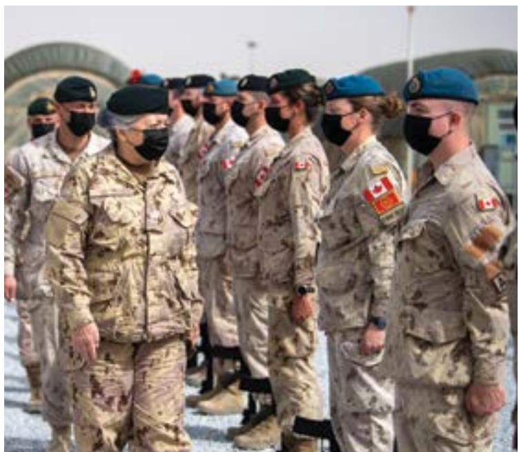
Visit to Camp Canada to meet with members of the Canadian Armed Forces engaged in Operation IMPACT. Kuwait, March 2022.