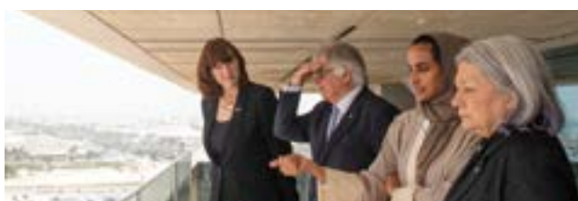
Governor General Mary Simon meets with Her Excellency Sheikhha Hind bint Hamad Al Thani. Qatar, March 2022