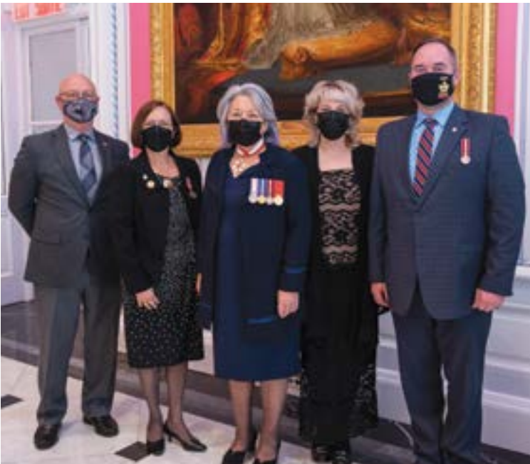
Governor General Mary Simon, presented honours to recipients, Rideau Hall, Ottawa, 2021.