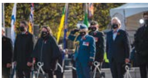
National Remembrance Day ceremony at the National War Memorial. Ottawa, November 2021.