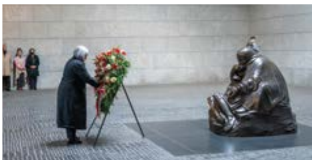
Governor General Mary Simon lays a wreath. Central Memorial of the Federal Republic of Germany, Berlin, October 2021.