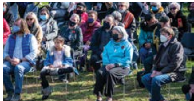
Annie Pootoogook Park naming ceremony on International Inuit Day. Ottawa, November 2021.