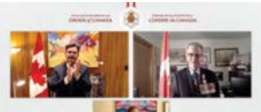
Virtual investiture ceremony of the Order of Canada. April, 2021.