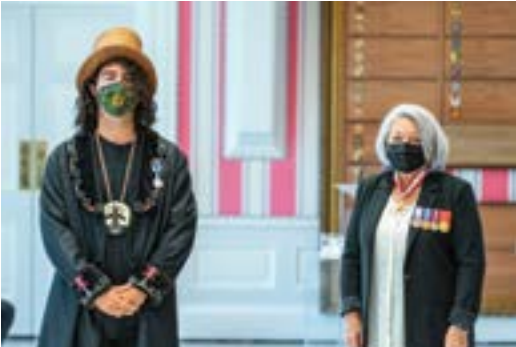
Presentation of a Meritorious Service Medal (Civil Division). Rideau Hall, Ottawa, September 2021.