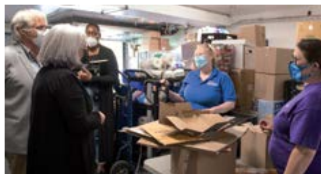
Visit to the Ottawa Mission. October 2021.