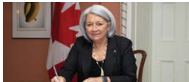
Governor General Mary Simon grants Royal Assent to Bill C 4. Rideau Hall, Ottawa, December 2021.