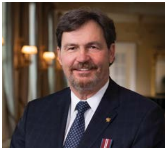
His Excellency the Right Honourable Richard Wagner, P.C., Administrator of the Government of Canada, Rideau Hall, Ottawa, February 2021.