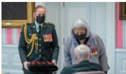
First poppy ceremony for the 2021 National Poppy Campaign. Rideau Hall, Ottawa, October 2021.