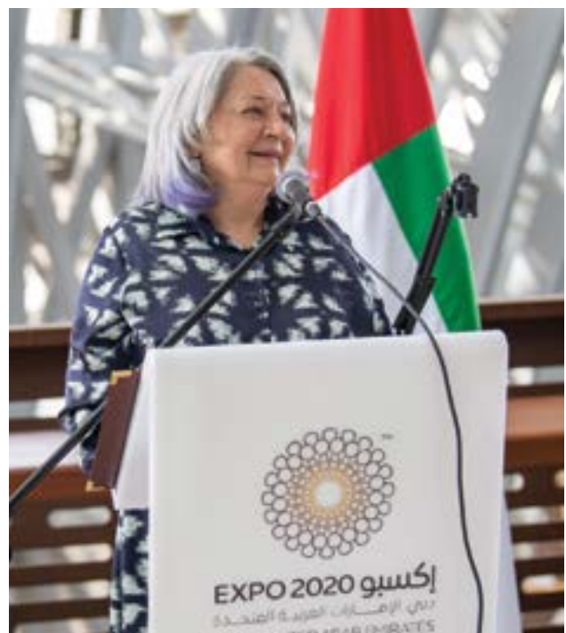
Canada National Day Ceremony at Expo 2020 Dubai. United Arab Emirates, March 2022.