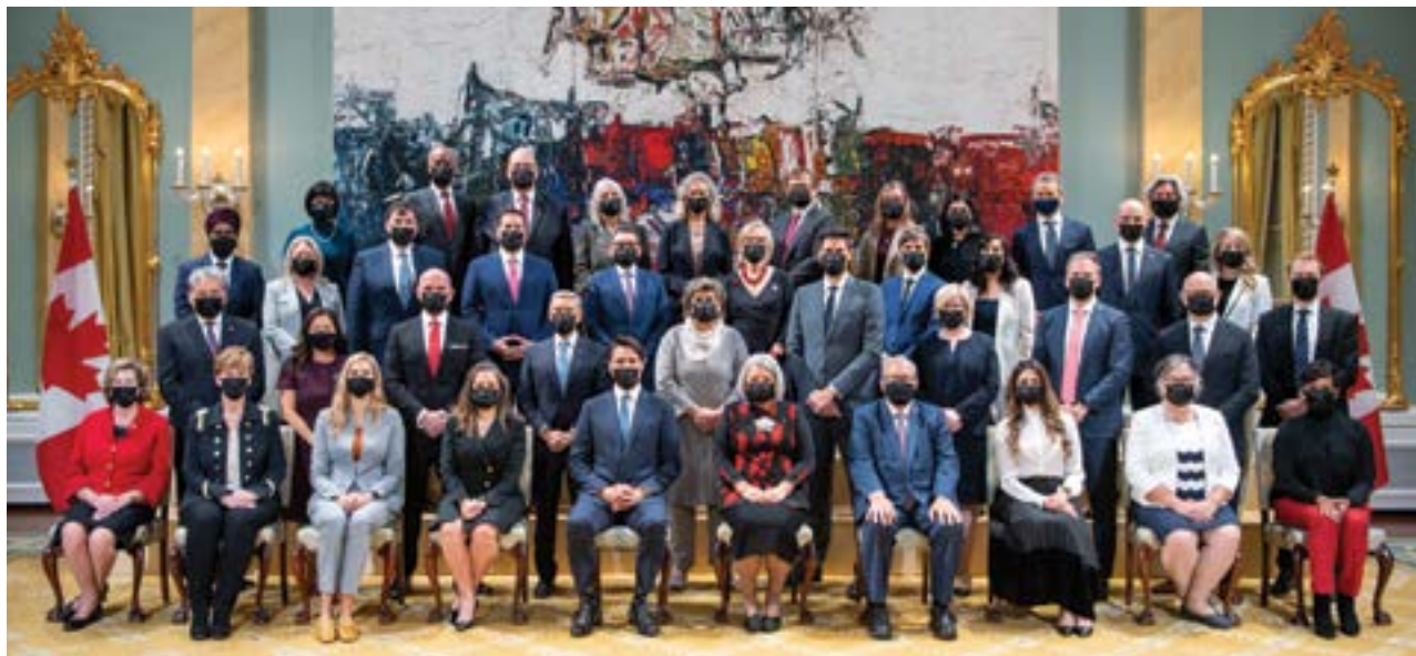
Swearing in ceremony of members of the Canadian Ministry, Rideau Hall, Ottawa, October 2021.