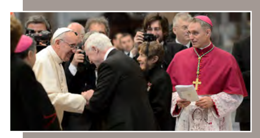
Following the Inaugural Mass on March 19, 2013, Their Excellencies were honoured with a brief audience with Pope Francis.