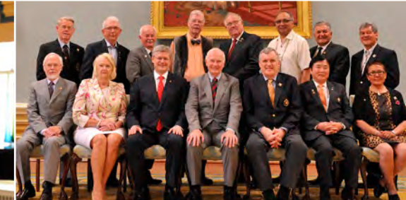
The participants of the annual conference of lieutenant governors and commissioners had the opportunity to meet with the Prime Minister at Rideau Hall.