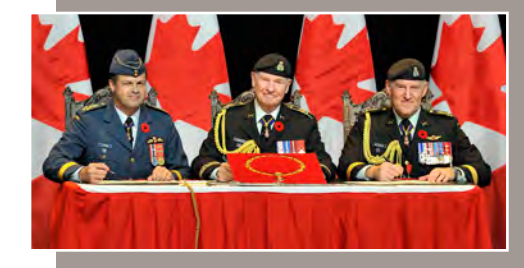
His Excellency, as commander-in-chief, signed the Change of Command certificates at the Canadian Forces Change of Command ceremony on October 29, 2012.