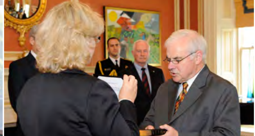
The Honourable Peter Milliken was sworn-in as a member of the Queen's Privy Council for Canada.