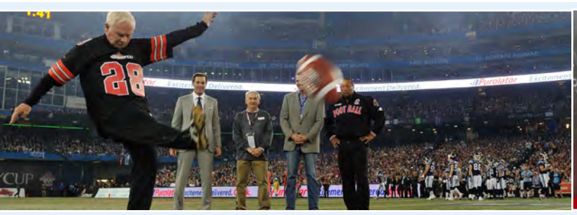
The Governor General attended the 100<sup>th</sup> Grey Cup and performed the ceremonial kick-off of the championship game between the Toronto Argonauts and the Calgary Stampeders.