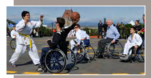
On October 22, 2012, the public was invited to a Fall Celebration at the Citadelle of Québec. A wheelchair basketball game was one of the activities that highlighted the benefits of physical activity.