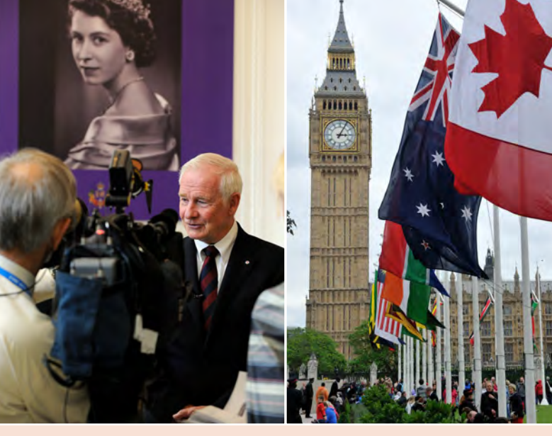
While in London to celebrate The Queen's Diamond Jubilee, His Excellency toured a photographic exhibit of The Queen's visits to Canada.

His Excellency the Right Honourable David Johnston June 1, 2012