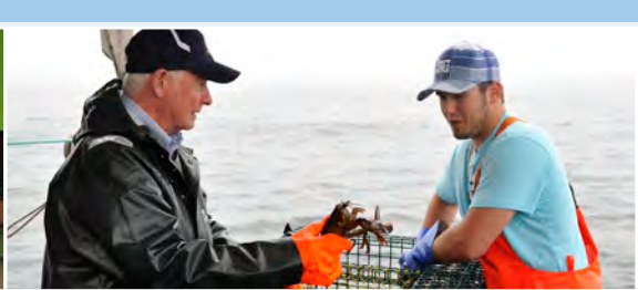
In Yarmouth, His Excellency went lobster fishing, an activity that is vital to the area's economy.