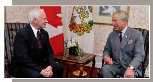
His Royal Highness The Prince of Wales met with the Governor General on May 24, 2012, during his Royal Tour of Canada.